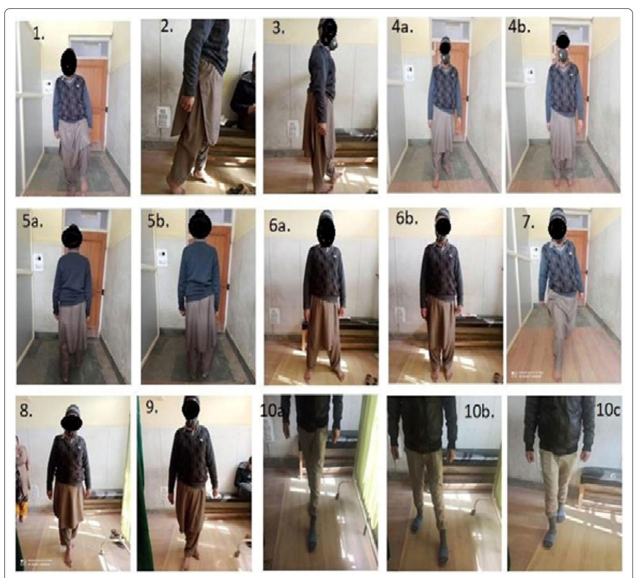
Fig. 1 (1-10c) 1.High Knee March 2. Toe Walking 3. Heal Walking 4a.4b. Wedding March. 5a,5b. Backward Wedding March. 6a, 6b. Side Stepping 7. Knee over Toe Position 8. Tandem Walk. 9. Cross Over Walk 10a, 10b, 10c. Modified Grapevine Walk

QT in reducing it significantly which suggests specificity of NMT towards co-contraction of QH (Fig. 3). Our data showed that NMT led to a significantly greater reduction in co-contraction of medial and lateral knee muscles than QT which indicates that NMT may reduce articular loads on the knee joint and this may have a long term protective effect, reducing the rate of joint destruction. Previous research has also demonstrated similar findings with reduced co-contraction of knee musculature after NMT program in subjects with ACL injury [36]. Interestingly, dynamic NMT has also been shown to improve knee muscle activity just prior to landing in young healthy